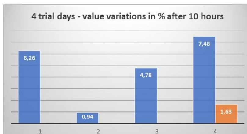
Figure 2. The shown bars illustrate relative changes in cell vitality values obtained (unsigned mean value / mean of 5 reading samples each), which came about from the difference or DELTA value calculations regarding "control case values" minus "exposed cells case values". They are given in percent each over four trial days repeated. The blue bars illustrate DELTA values seeing the exposed cultured cell groups (cell dish) very closed to the Sferics emitter antenna by a headphone. Additionally, the orange bar (right side) show DELTA a value as an additional experiment scheduled at the same time on the 4th day of the experiment but the cell dish was placed remote from the Sferics emitter antenna.